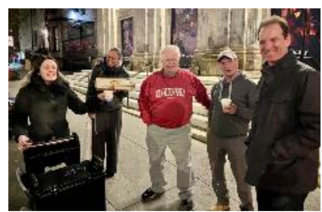
Thank you to all who helped with the MIDNIGHT RUN!