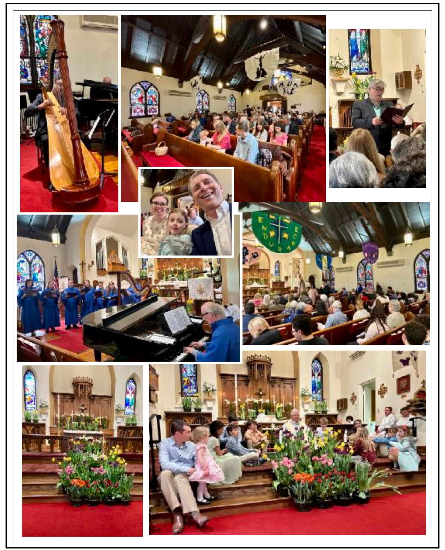
St. John's Lutheran Church, Fenimore Road at Cortlandt Avenue, Mamaroneck, NY 10543